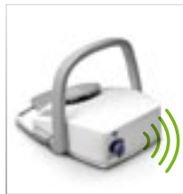
Wireless Foot Pedal optional for S3, standard for S5.