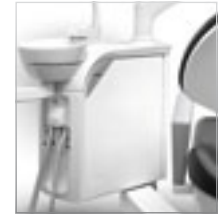
Hydric box made of anticorrosive aluminium and with 70° turn.