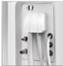
Quick connection Kit: USB port built + air/water intake + output 230V.