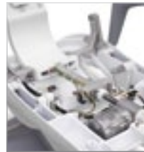
Robust build quality and cutting-edge technology.