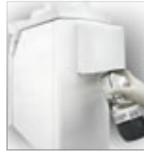
Independent water supply system for instruments on the equipment.