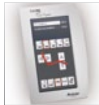
Touch Express technology. Simple, clear and intuitive.