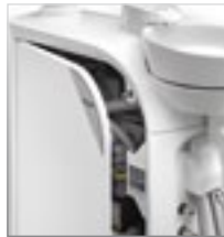
"Touch Open" door giving easy access inside the cuspidor.