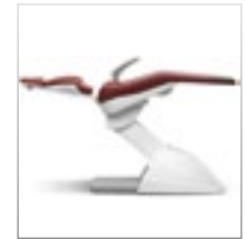
Wide lifting range from 400 to 810 mm.