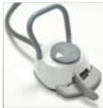
Series 1 progressive pedal.