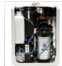
"WEK" water decontamination system.