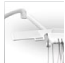
Optional auxiliary tray (400 x 300 mm.)