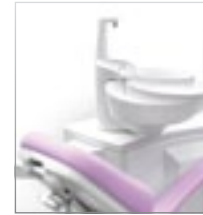
Porcelain cuspidor bowl, manually revolving at Series 5.