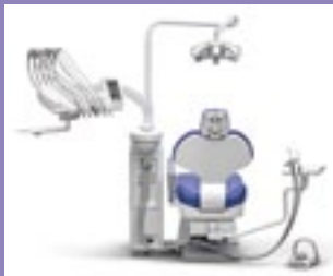
Left handed working position.