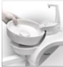
Removable and autoclavable porcelain cuspidor bowl.