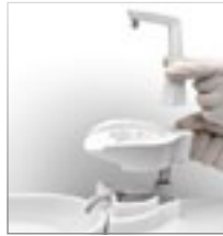
Removable cup filler for an easier cleaning.